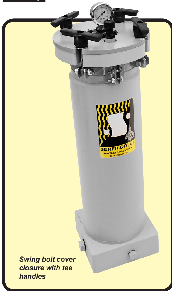
Swing bolt cover closure with tee handles